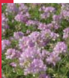
State Plant Penngift Crownvetch