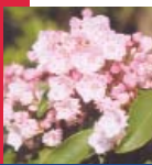
State Flower Mountain Laurel