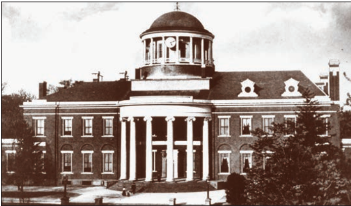
Harrisburg has been the capital of Pennsylvania since 1812. The main building of the original Capitol, pictured here, was destroyed by fire in 1897.